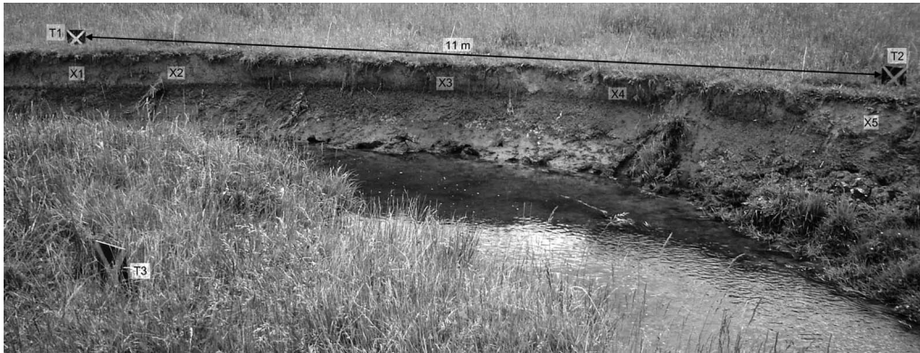
Fig. 1. Image of streambank showing locations of scan targets (T's) and cross sections (X's)

(DEMs) over time to detect change. There has been some research involving TLS for measuring erosion from streambanks and coastal cliffs at a relatively large scale (bank heights ranging from 14 to 65 m and resolutions ranging from 0.03 to 0.1 m) (Lim et al. 2005; Rosser et al. 2005; Collins and Sitar 2008). The potential, however, for using TLS for recording undercut banks and small-scale changes has been noted by Rosser et al. (2005). Heritage and Hetherington (2007) used TLS to scan a 150-m stream reach at 0.01-m resolution. When the data were compared to 257 independent survey points, they found a mean error of 0.004 m with a standard deviation of 0.17 m and 55% of the survey data within \pm 0.02 m of the TLS data.